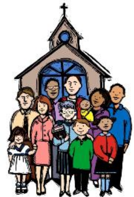
Our Church Family

Need to sign up for flowers for that special date – sign up now or call the church office (419-238-0631, ext. 0). Dates will go fast!