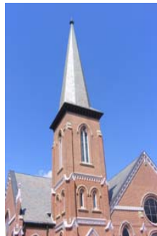
Jefferson @Central Van Wert, Ohio