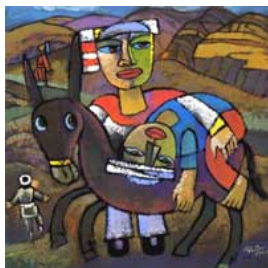
February Rotation is The Great Commandment Art by He Qi