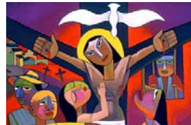
March Rotation is “Crucifixion” Art by He Qi

“For God so loved the world that he gave his only Son, so that eve- ryone who believes in him may not perish but may have eternal life. “ John 3:16