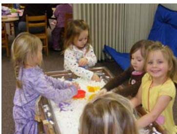
Kids are having fun at Pajama Day.