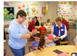
Grandparent's Day photo